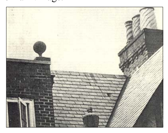
Any installation on a roof should not result in the loss or alteration to distinctive architectural features such as shingles, chimney pots, or other decorative details.

Like mechanical equipment, solar panels or photovoltaic shingles should be installed where they are not visible from a street. The installation of photovoltaic shingles on primary elevations is an incompatible alteration that would alter the appearance of the slate roofs that are a significant architectural feature of Foxhall Village.