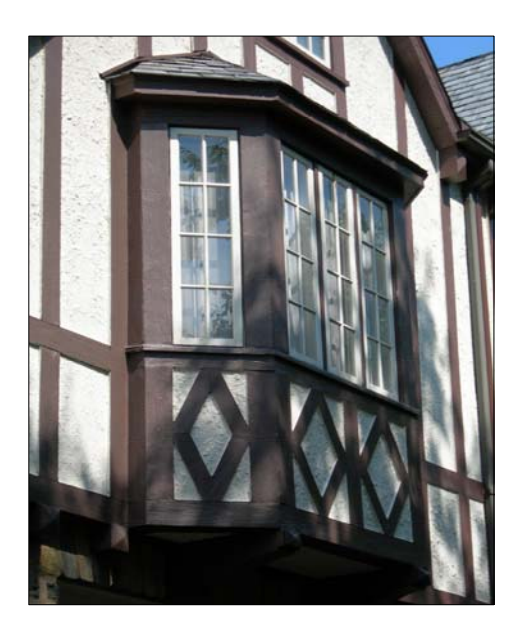
The first option for historic windows should be repair rather than replacement.

The design, materials, and variety of window types are important to the architectural character of the Foxhall Village Historic District. The mixture of multi-pane double-hung windows, casement windows, and leaded glass windows on primary elevations contribute to the neighborhood's appealing Tudor Revival character. Repair and restoration of original windows is strongly encouraged and should be investigated prior to consideration of replacement. In many cases restoring original windows to good operable condition and/or installing storm windows can achieve similar energy efficiency to modern replacements – typically at a fraction of the cost.