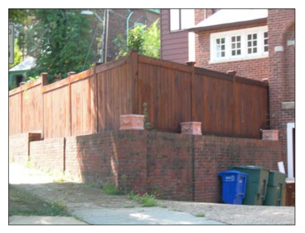
Fences in side yards can have a negative visual impact and alter the open nature of the yards that is characteristic of Foxhall Village.

be no higher than 42" and have a 50% solid to void ratio and have a historic appearance compatible with the character of the neighborhood.