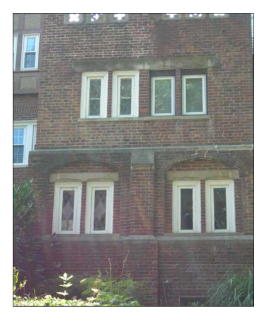
The replacement of historic windows with new windows that fail to match the details, configuration, and finish of the originals results in the loss of a significant architectural feature.

Because the primary elevations of buildings in Foxhall Village are carefully composed and typically relate to a rhythm and pattern of fenestration that extends throughout a row, altering the size of existing window openings or creating new windows on primary elevations is almost never appropriate. New window openings on secondary elevations may be possible if they are consistent with the style of the building and its pattern of fenestration, and do not result in the alteration of any important architectural features.