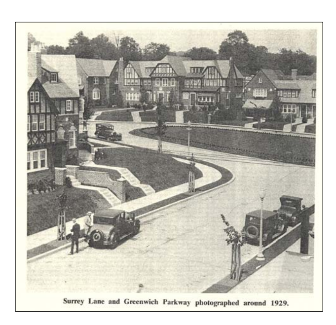
A 1929 view of Foxhall Village shows how the street pattern and siting of the houses conforms to the topography of the land.

The design of Foxhall Village illustrates how equal attention was paid to both the architecture and the landscape planning of the neighborhood. The street plan conforms to the natural topography of the land and includes such features as landscaped traffic circles and medians, creating picturesque views throughout the neighborhood. Enhanced today by mature plantings, Foxhall Village conveys an informal, park-like setting.