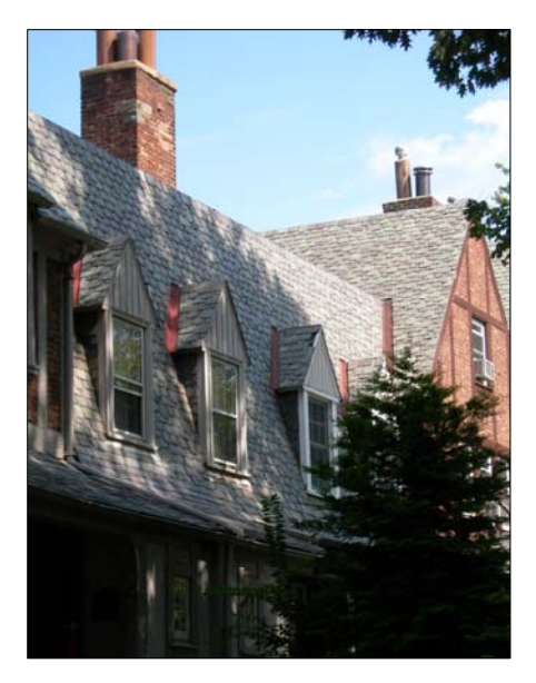
The slate roofs of houses in Foxhall Village were laid in subtle patterns that should be replicated in any replacements.

elevations or rear additions, can be replaced either in-kind or with an alterative material.