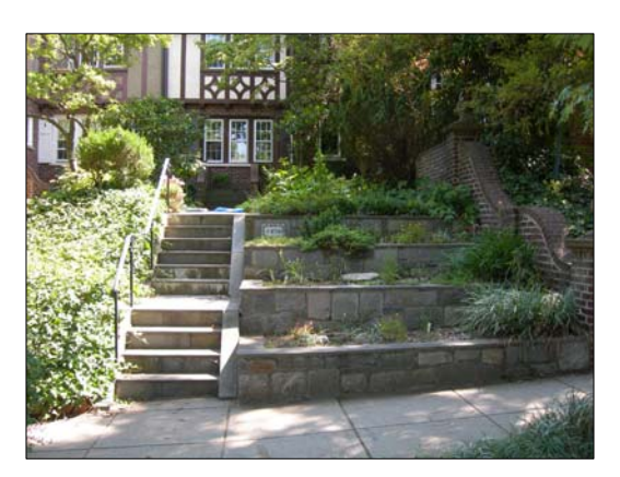
Adding terraces to front yards (above) results in the loss of the historic topography and introduces retaining walls that damage the historic open character of the district (below).

Reconstructed or new retaining walls should match these historic retaining walls in height, material, craftsmanship and overall appearance. In order to retain the neighborhood's naturalistic topography, terracing sloping front yards with multiple retaining walls should be avoided. Similarly, to retain the open, parklike feel of the district, free-standing walls in front yards between properties should also be avoided.