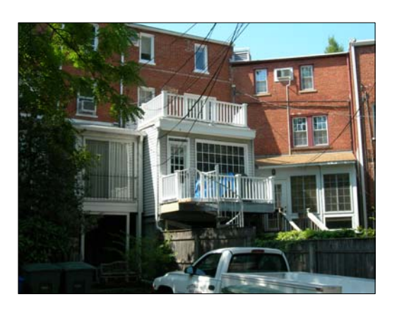
These rear additions, decks and porches are compatible in size and placement, and have no impact on the architectural character of the neighborhood.

Adding to the front of a building in Foxhall Village historic building is rarely – if ever – appropriate, as it would cover the significant architectural features of the primary elevation, significantly alter the appearance of the building, and change its relationship with neighboring properties. Enclosing front porches, adding projecting bays on houses that do not already have or historically did not have them, excavating for the creation of basement entrances where the grade is flat, or adding garage entrances are all incompatible alterations on primary elevations.