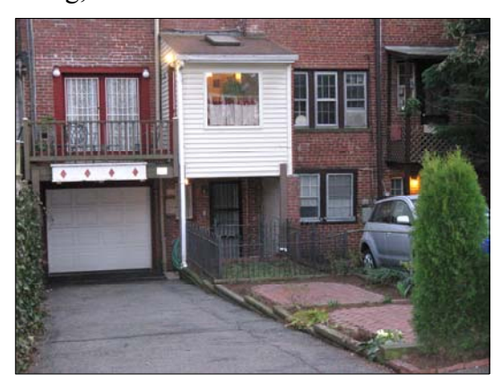
The rear yards in Foxhall Village contain both garages and parking pads accessed off of the alleys.

If a new garage is planned, it should be clearly subordinate in size to the house and should reflect other alley buildings in terms of height, massing, or materials.