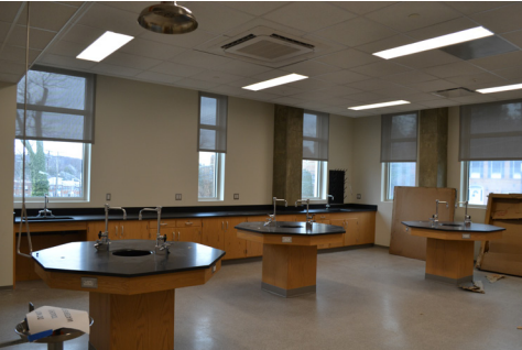
Pictured above: Lab School interior pictures

of these confusing times, all hold hands!