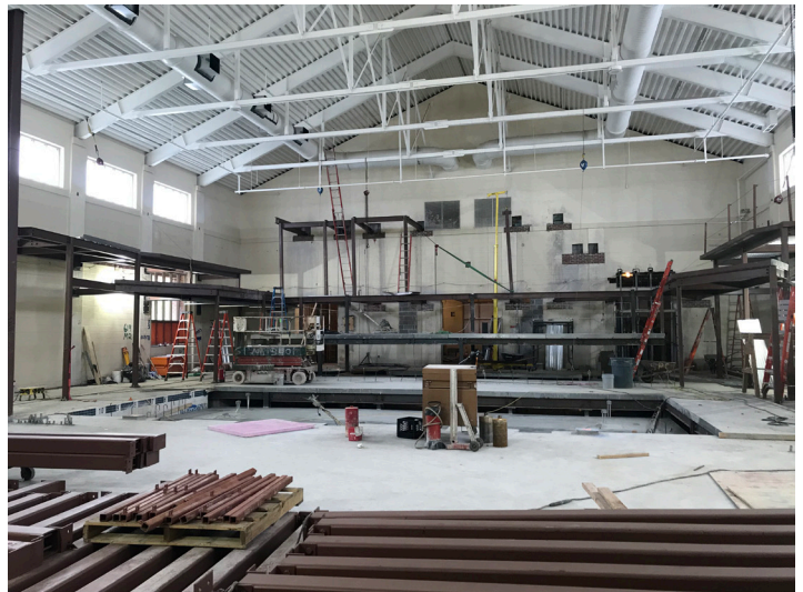
Looking out from the new stage

PALS has begun preparations for its biggest event of the year – The Lab School Spring Fair. The Fair is being held this year on Sunday, May 19. The change of venue last year to our Foxhall campus (1550 Foxhall Road, NW) was a success, and we will hold the fair there again this year. There will be rides, games, a rummage sale sponsored by the student council, and food, including – new this year – an international food court. Lab's Fair is open to the public, and we hope our neighbors will come join in the fun.