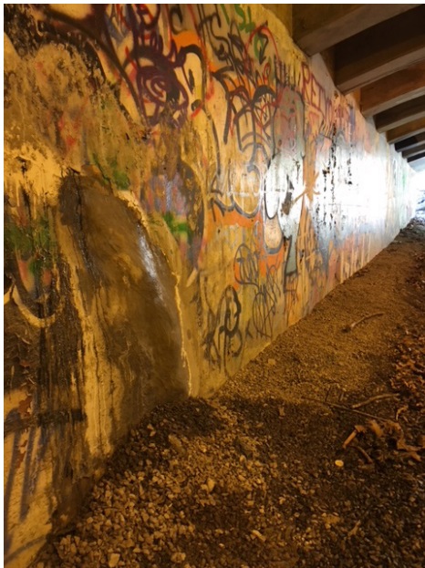
STINKY GRAFFITI: Lines show on March 24, 2019 along a crack patch in the tunnel under Canal Road at Glover Archbold National Park, where a sewage leak broke through in mid-March.