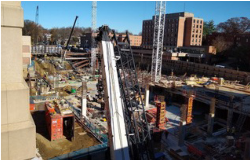
From Levey Center towards Reservoir Road, 3 stories deep.