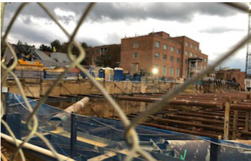
From the Reservoir Road Gate towards St. Mary's Hall and the concrete batch plant. Excavation in front of St. Mary's will take place next spring.