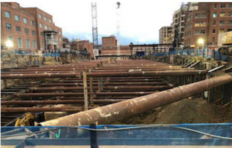
From the Reservoir Road Gate towards Levey Center.