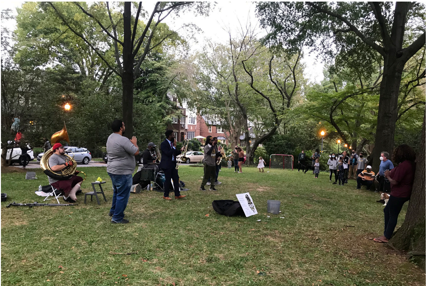
BRASS BLAST: Native D.C. band Crush Funk popped up on Greenwich Circle on September 24 to blow away the Covid-19 blues, drawing residents outdoors for a mix of hits that went on for more than an hour.