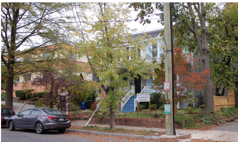
ONE TIMES NINE?: An application has been submitted to city zoning authorities to convert a single-family dwelling at 4457 MacArthur Blvd., shown here on October 31, to a nine-unit complex.