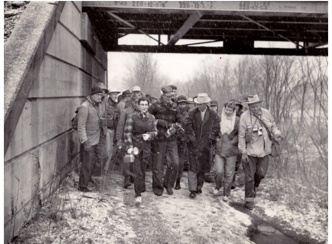
The C&O Canal troupe, pushing on through a blinding snowstorm, passes beneath a Western Maryland Railroad trestle on March 21, 1954. Justice William O. Douglas is on the right.

increasing coal trade made the canal profitable. In its peak year 1871, around 850,000 tons were carried down the canal. During these few profitable years, more than 500 boats were using the canal. However, by the late 1870s, floods, competition from the B&O Railroad, and a financial panic strained the profitability of the canal. In 1924, the B&O Railroad bought the Canal’s bonds and ended the operation of the canal.