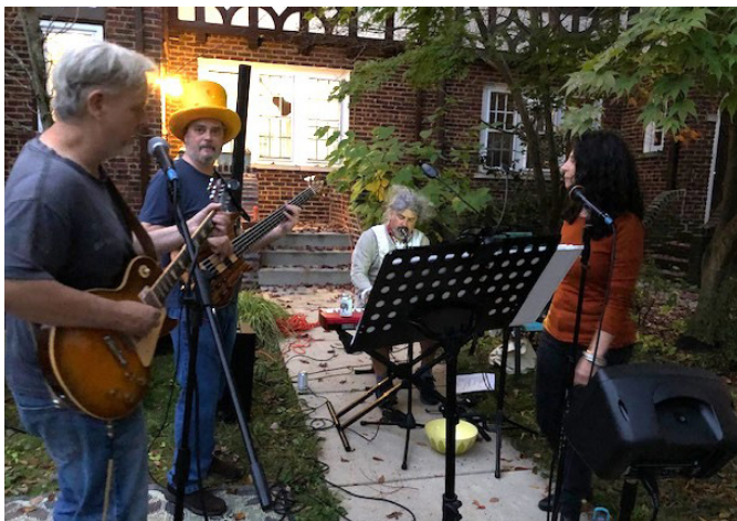
Entertaining Trick or Treaters