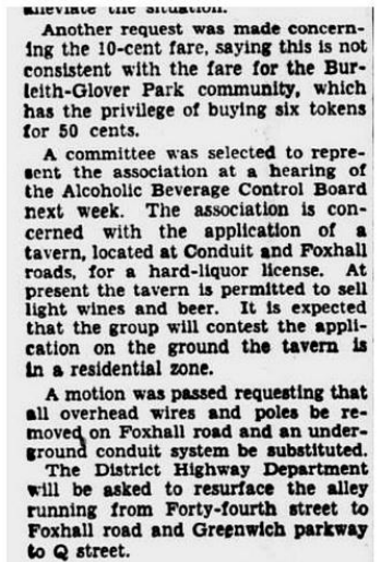
Article published in the Evening Star , October 16 th , 1935

In the early decades of the FCCA, these included efforts to get better transportation into downtown, to create the playground at what is now Hardy Park, and to get a local public school built to serve children in the neighborhood (Hardy School, built in 1932, now houses the Lab School lower campus). Of course, as noted in the November 2025 Foxhall News article on housing segregation, associations could also play a role in exclusionary policies perceived as serving the neighborhoods interests.